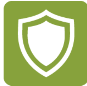
Safety / Crime Victims